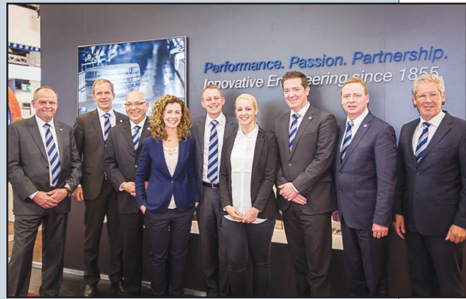
HF Curing Presses Team 2015