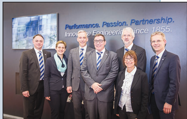
HF TireBuildingMachines Team 2015