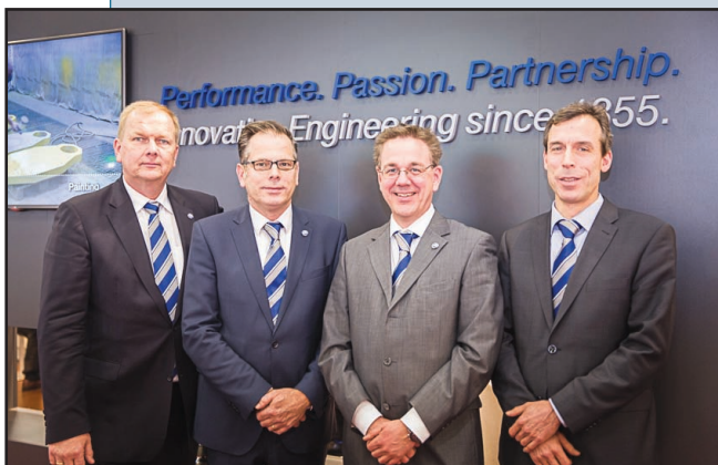
HF Extrusion Team 2015