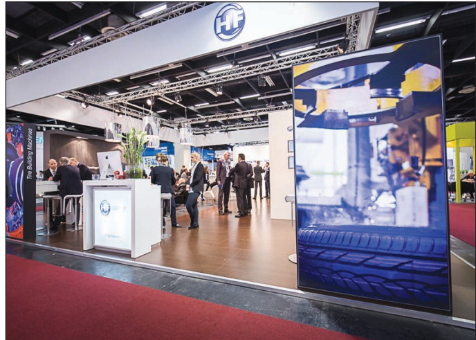
HF TireTech Group's outstanding stand