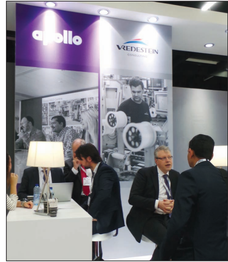
Stand of Apollo-Vredestein