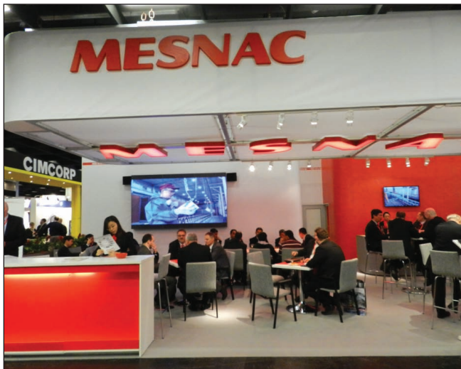
MESNAC’s magnificent stand