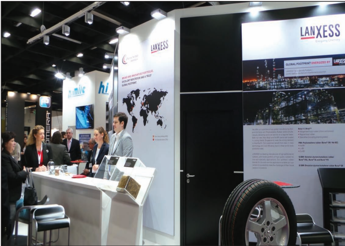
LANXESS' very good stand with RheinChemie also showcasing