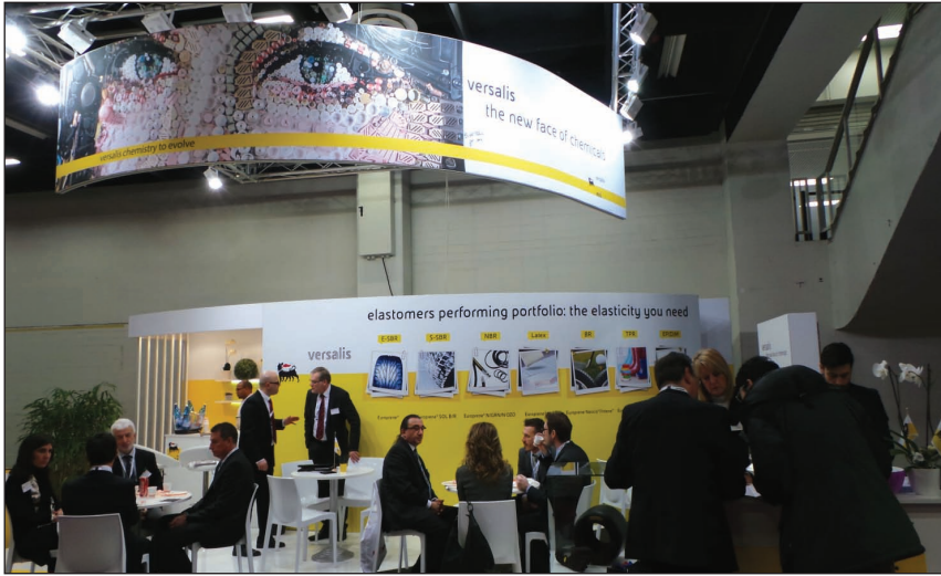
Prominent stand of Versalis ENI SpA of Italy had a rapid flow of customers at all times